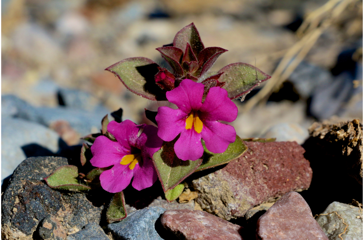
▲ Mimulus bigelovii var. bigelovii (Bigelow's monkey-flower)

white Rafinesquia neomaxicana (desert chicory), shrubs, and sand verbenas.