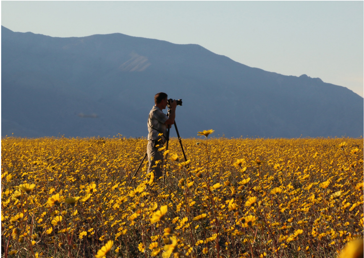
▲ Geraea canescens (desert gold)