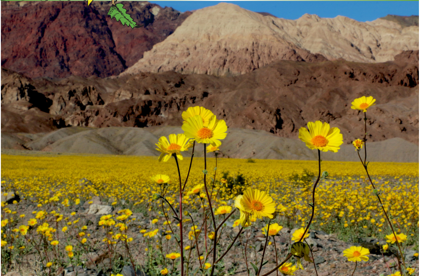
Geraea canescens