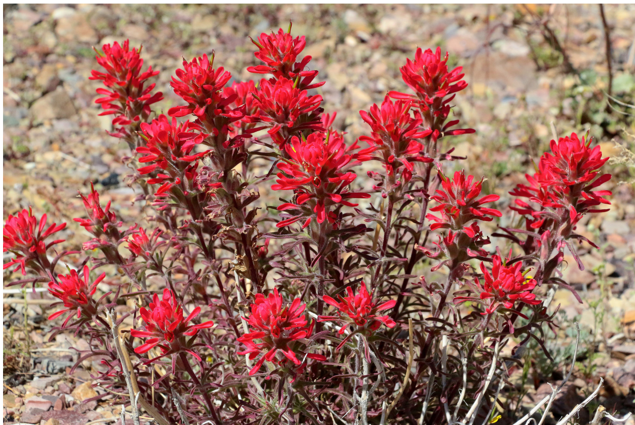
▼ Castilleja chromosa (Desert paintbrush)