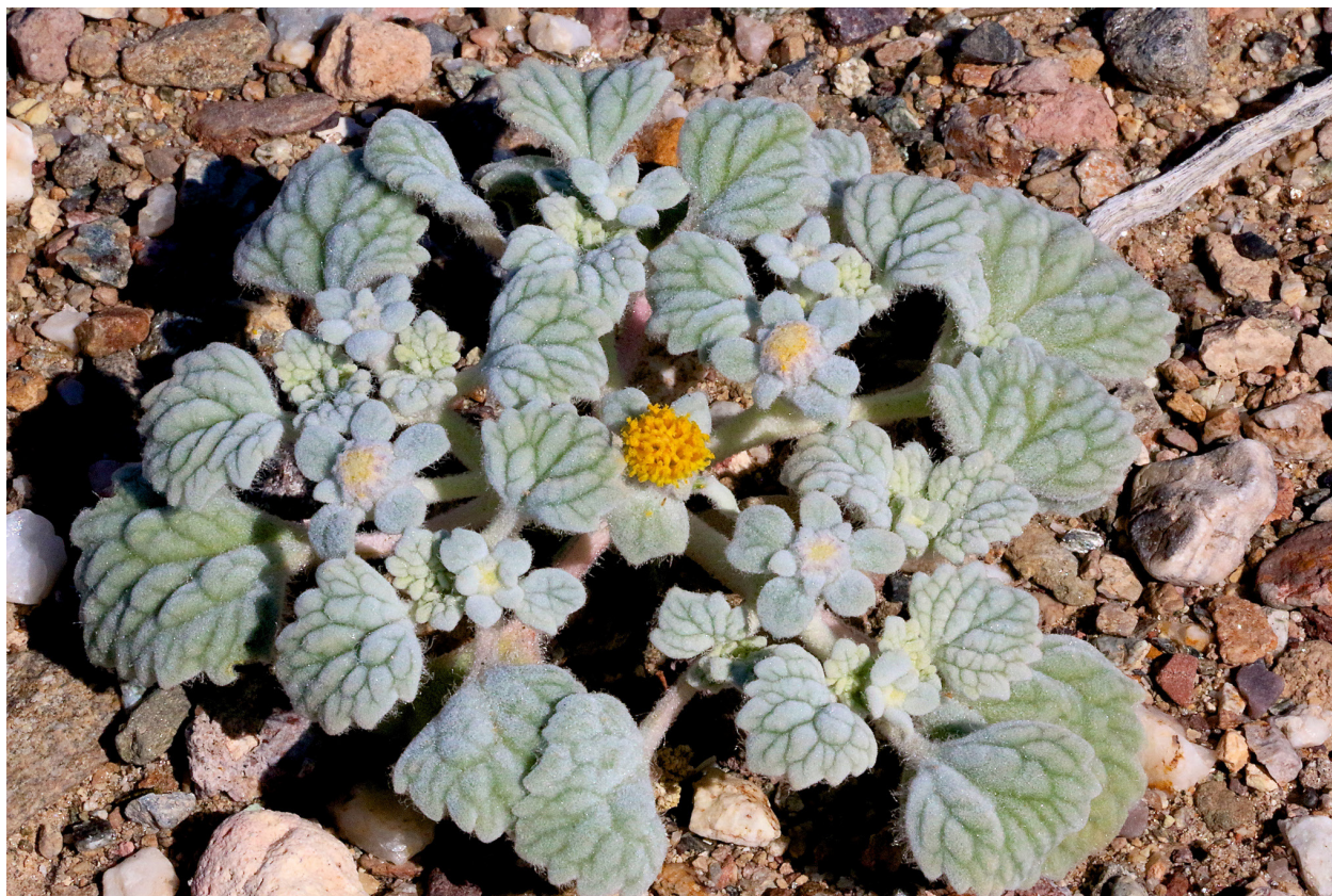
▲ Psathyrotes ramosissima (desert turtleback)