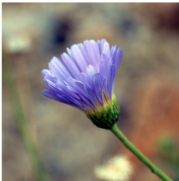
▼ Xylorhiza tortifolia var. tortifolia (Mojave aster)

Mixed in with the yellows were white Atrichoseris platyphylla (gravel ghost), purple phacelias (notch leaf and calthaleaf) and pink/purple Nama demissum (purple mat), pink Eremalche rotundifolia (desert five-spot) and Abronia villosa (desert verbena). A stroll through the desert washes revealed some of the smaller flowers, such as two dainty white daisies ( Monoptilon bellioides and Perityle emoryi ), two primroses - Camissonia boothii ssp. condensata (shredding evening primrose) and brown-eyed evening primrose ( Camissonia claviformis ) and brilliant pink Mimulus bigelovii (Bigelow monkey-flower). Hiking up canyons into the higher elevations brought discoveries of Death Valley endemics, such as rock monkey flower ( Mimulus rupicola ) which grows in cracks on limestone cliffs, as well as light violet Phacelia fremontii and delicate white Cryptantha utahensis (scented cryptantha) which perfumed the area. Near Daylight Pass we found an endemic ephedra ( Ephedra funerea ) sheltering the weak-stemmed white sunflower, Rafinesquia neomexicana (desert chicory).